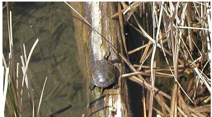
A turtle suns itself near the proposed multiple dock site

The Leelanau Enterprise (Thursday Sept. 25, 2008) observes, "The biggest challenge before Tyge can begin constructing docks may be finding financing, which at one point in the long approval process he had secured." According to Tyge, NLDC legal expenses for this case are upwards of $190,000. Averaged over 22 units, this comes to almost $9,000 per unit. The Lake Association, which itself has already incurred legal expenses upwards of $150,000 fighting the marina, plans no further appeals.