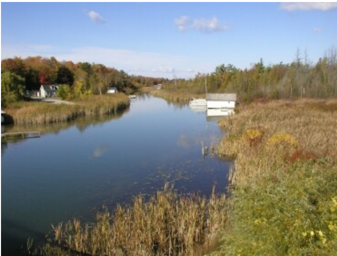
The Narrows with boathouse in background